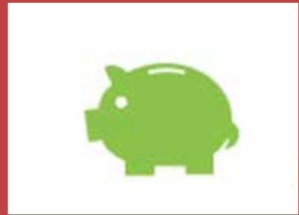
Free 3 Week Money Course