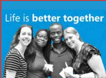
Small Group Social