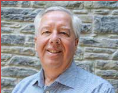
Our New Trustee