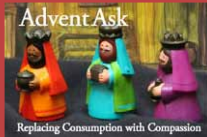
Advent Ask p5