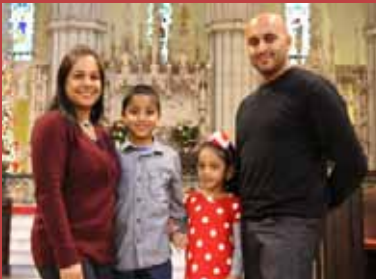
Christmas at St. Paul's p4