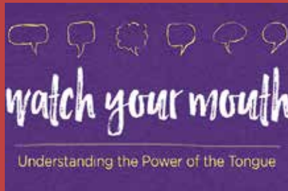
Young Professionals Night