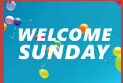
Mark your calendars